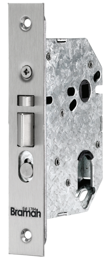
Escape Nightlatch with Snib