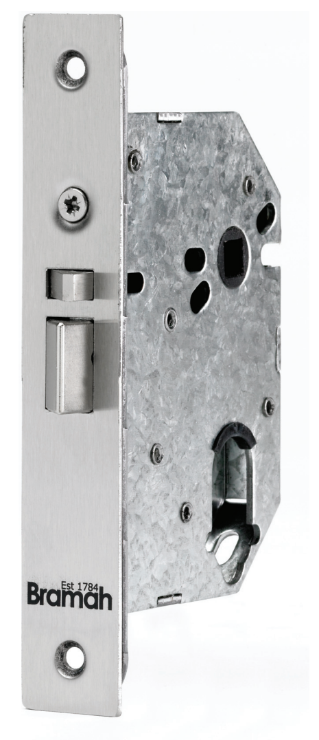
Escape Nightlatch without Snib